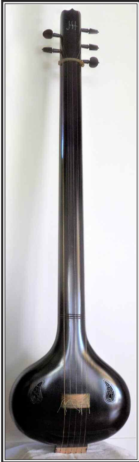
5-string Dhrupad Tambura in aubergine

The base price for an instrument is $3000 (shipping additional)